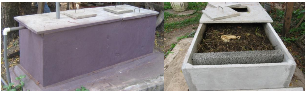
The Biofil Digester

The Biofil Digester is a simple compact on-site organic waste treatment system that uniquely combines the benefits of the flush toilet system and those of the composting toilets and eliminates the disadvantages and drawbacks of both systems.