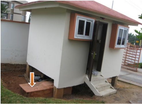
Biofil Digester installed at a security post