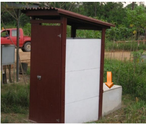
Stand-alone toilet with Digester