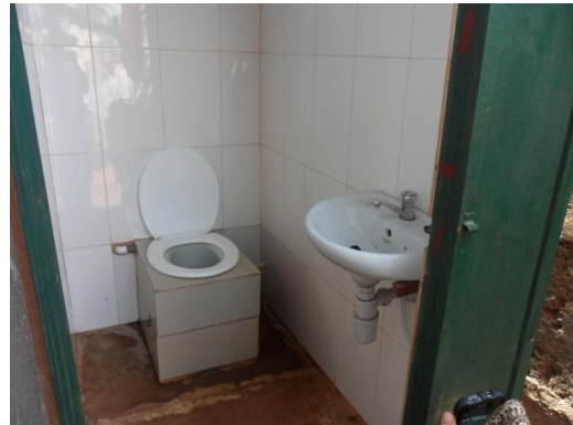
Microflush Biofil Toilet system