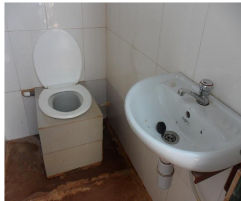
Tiled interiors of Biofil Microflush Toilet