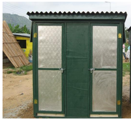
Biofil Toilet attached to a security post