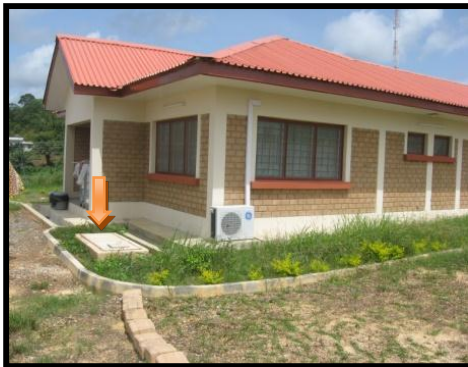
Digester installed at new residential