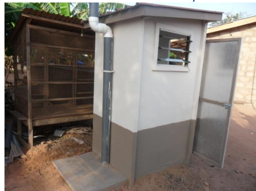
Biofil Digester installed at a School in Pokuase