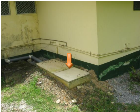
Biofil Digester at Iduaprim Mines Estates