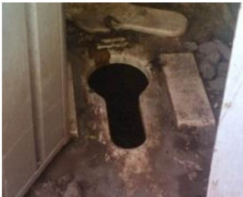
KVIP squatting Hole

Stand-Alone units can be used as flush and microflush Units.