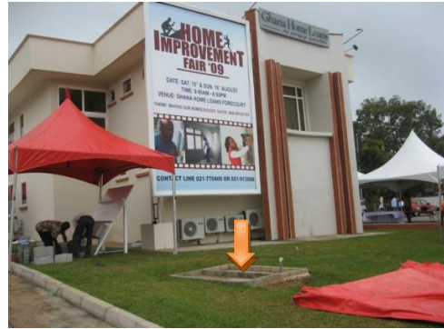
Biofil digester installed at Ghana Home Loans Office block