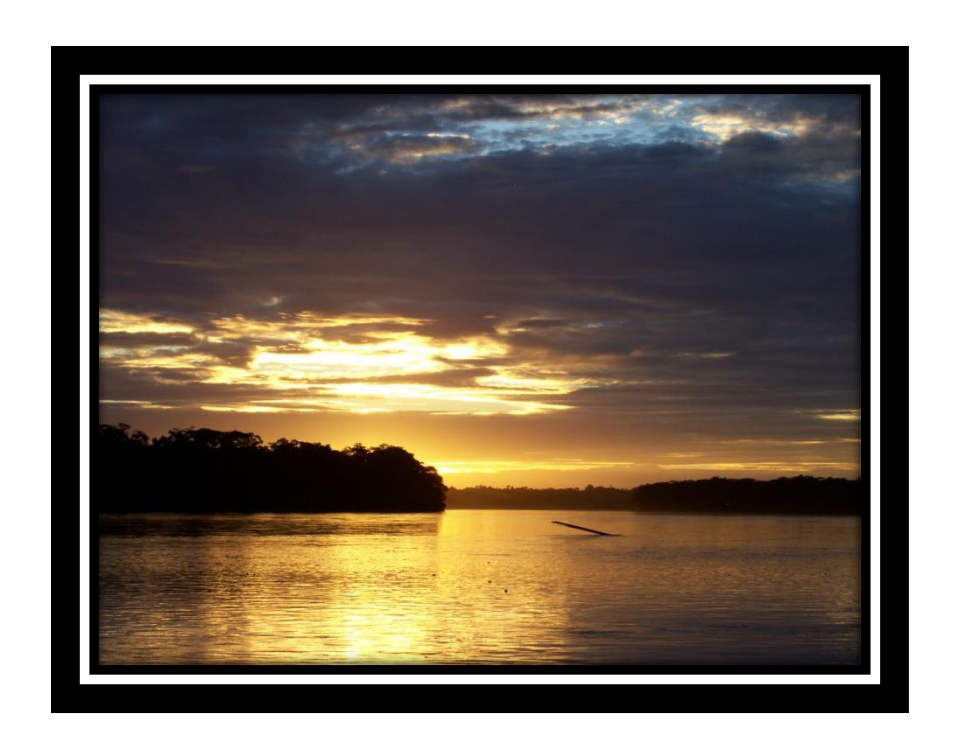
Submitted to: Estes Valley Sunrise Rotary Club

Kutsutkao Village, Achuar Territory, Pastaza Province Ecuador Village Water Purification and Distribution Project