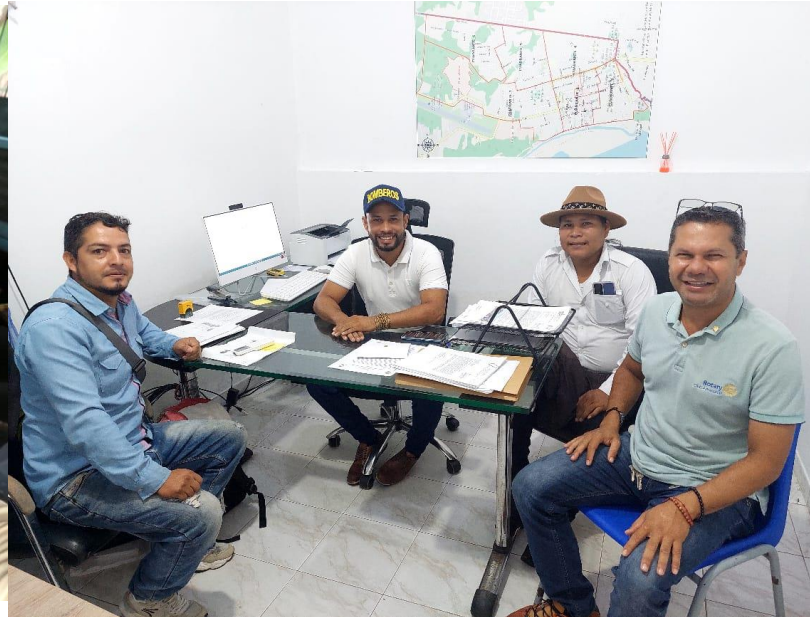
Meeting Secretary of the Government of the Leticia Mayor's Office President and Project Chair R C Amazonas