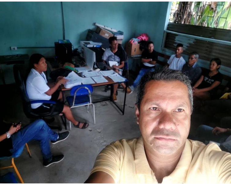
Meeting Corpoamazonia – Environmental authority Asolagos E.S.P. R C Amazonas

Looking for alliances with State authorities and the community