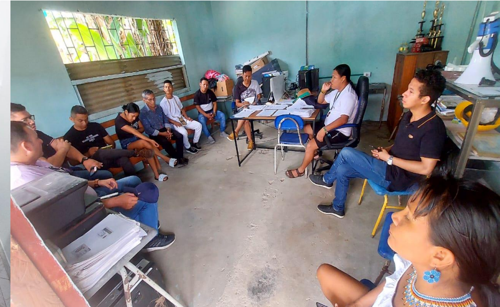
Meeting Asolagos E.S.P. – Aqueduct Administration R C Amazonas