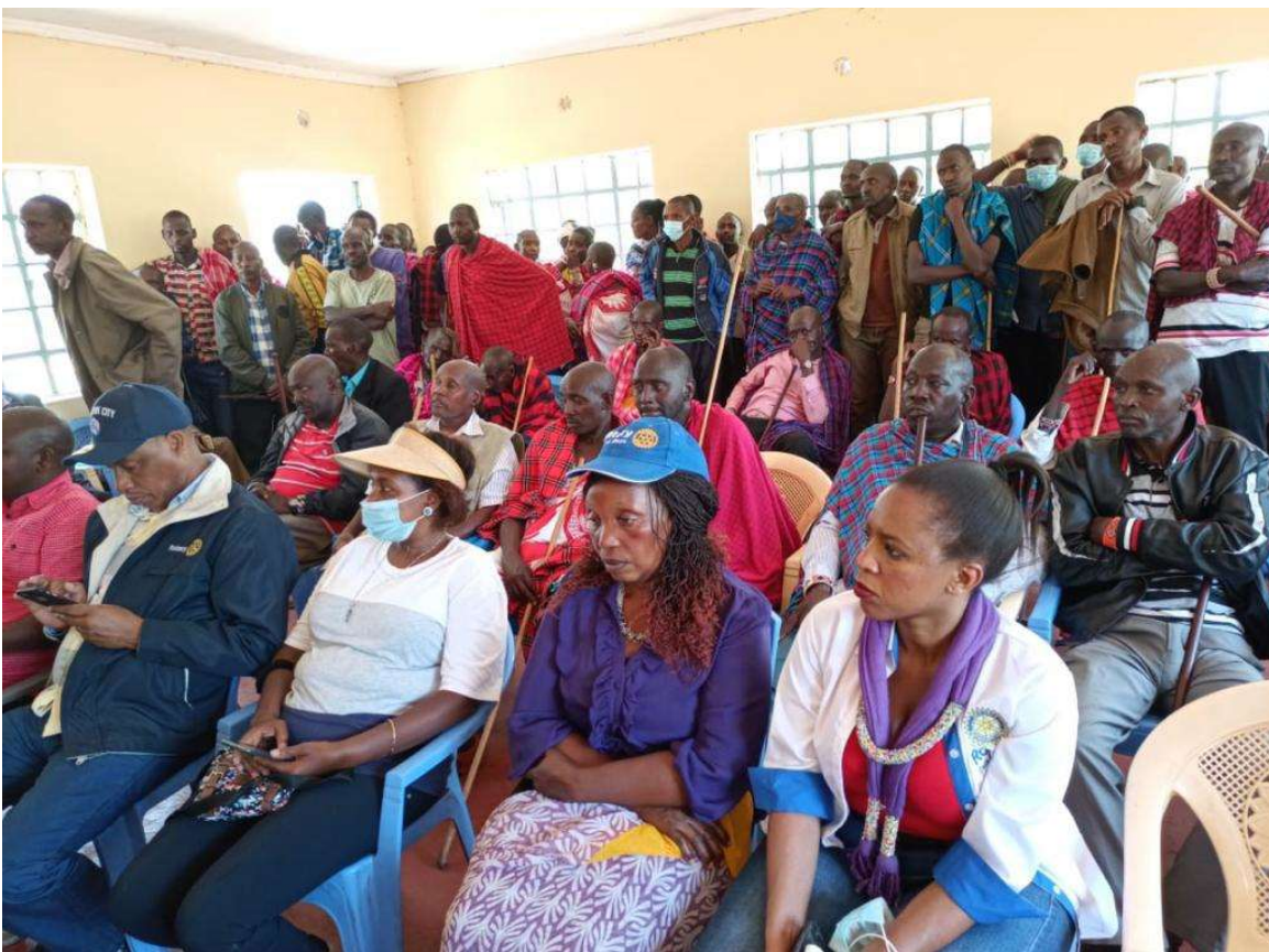
Rotarians in an economic empowerment Seminar with the proposed beneficiary community.