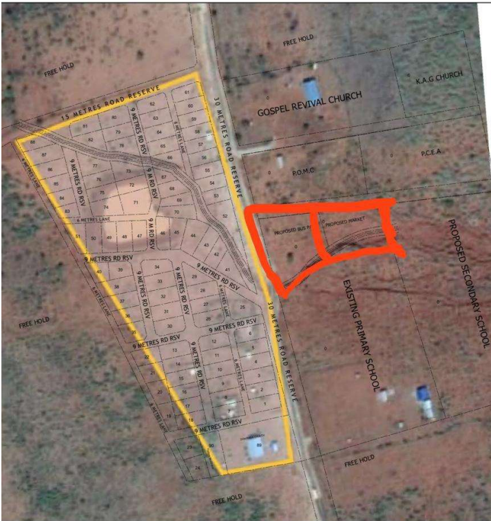
Satellite Image Of The Proposed Site Of The Project land.