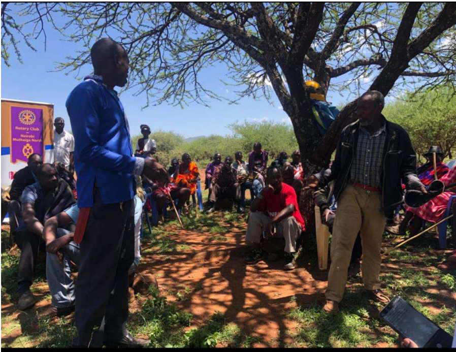
Rotarians conducting needs assessment and peace baraza