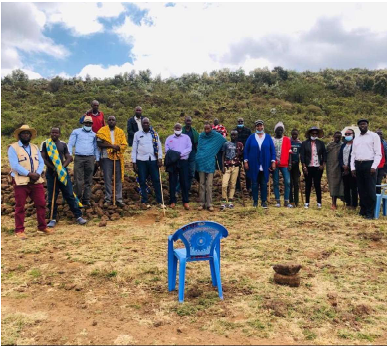
Rotarians in a needs assessment with community elders of the beneficiary community.