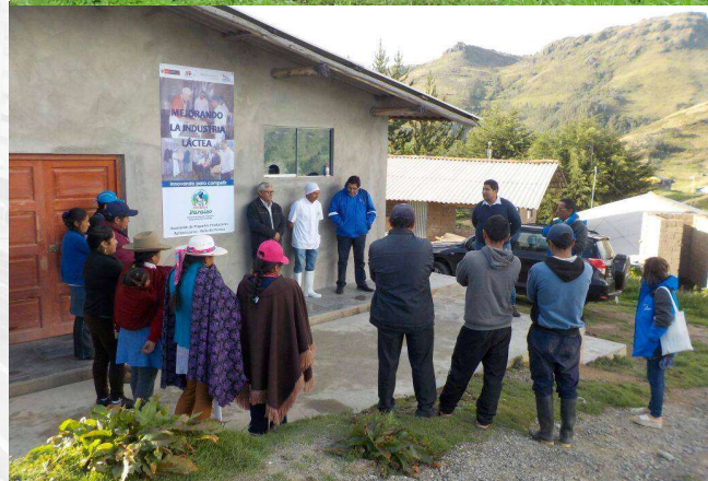
Fusión Latina meeting with beneficiaries