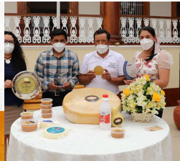
Potentially high-quality dairy products

Coordinación Regional de La Fundación Rotaria zona 23B