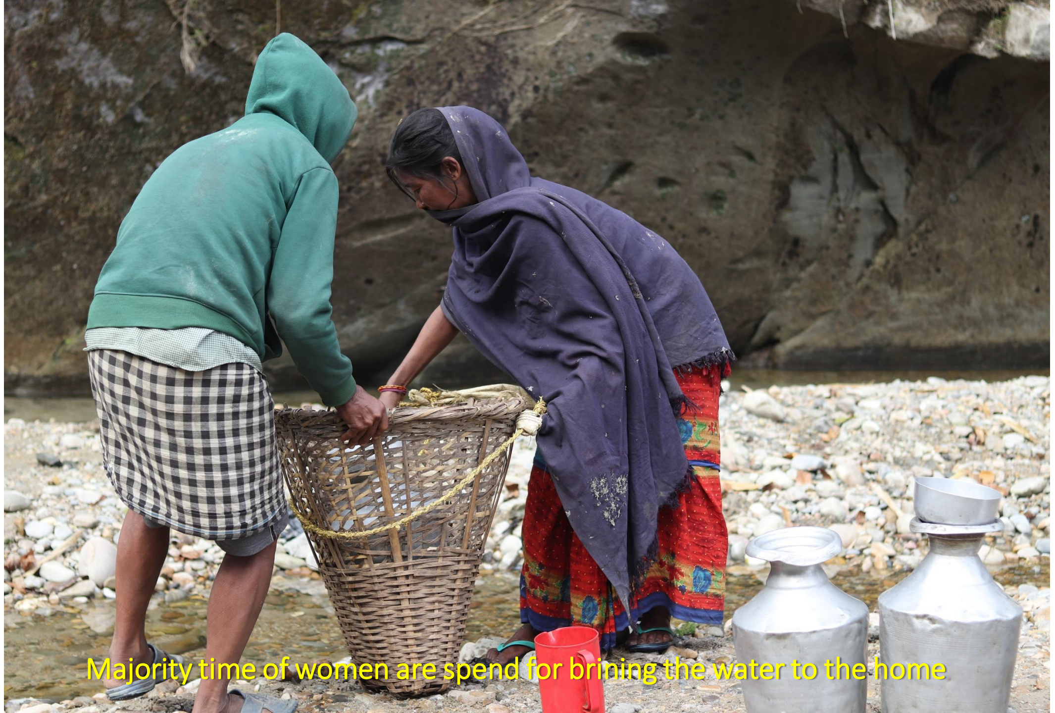
Majority time of women are spend for brining the water to the home