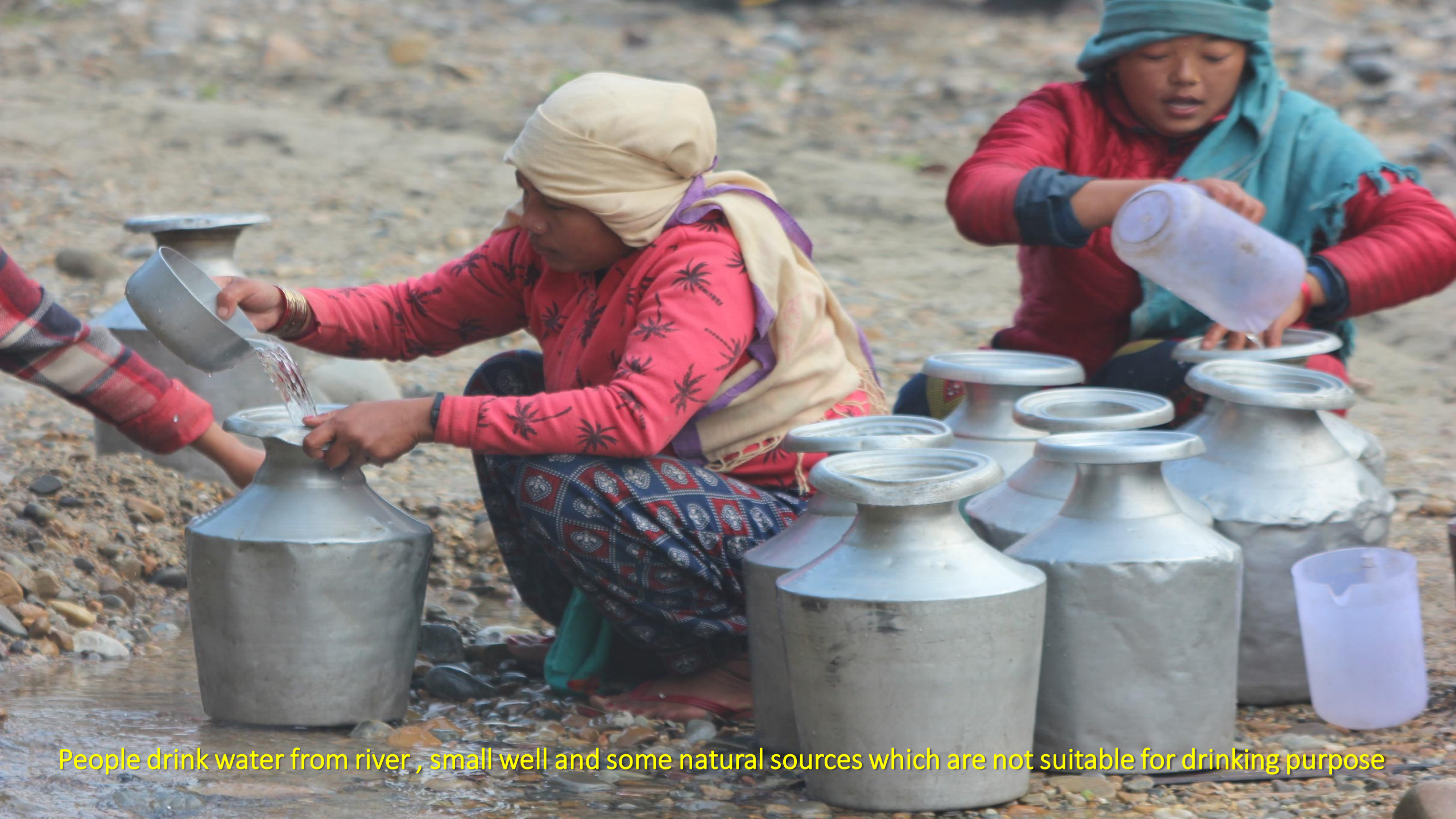
People drink water from river , small well and some natural sources which are not suitable for drinking purpose