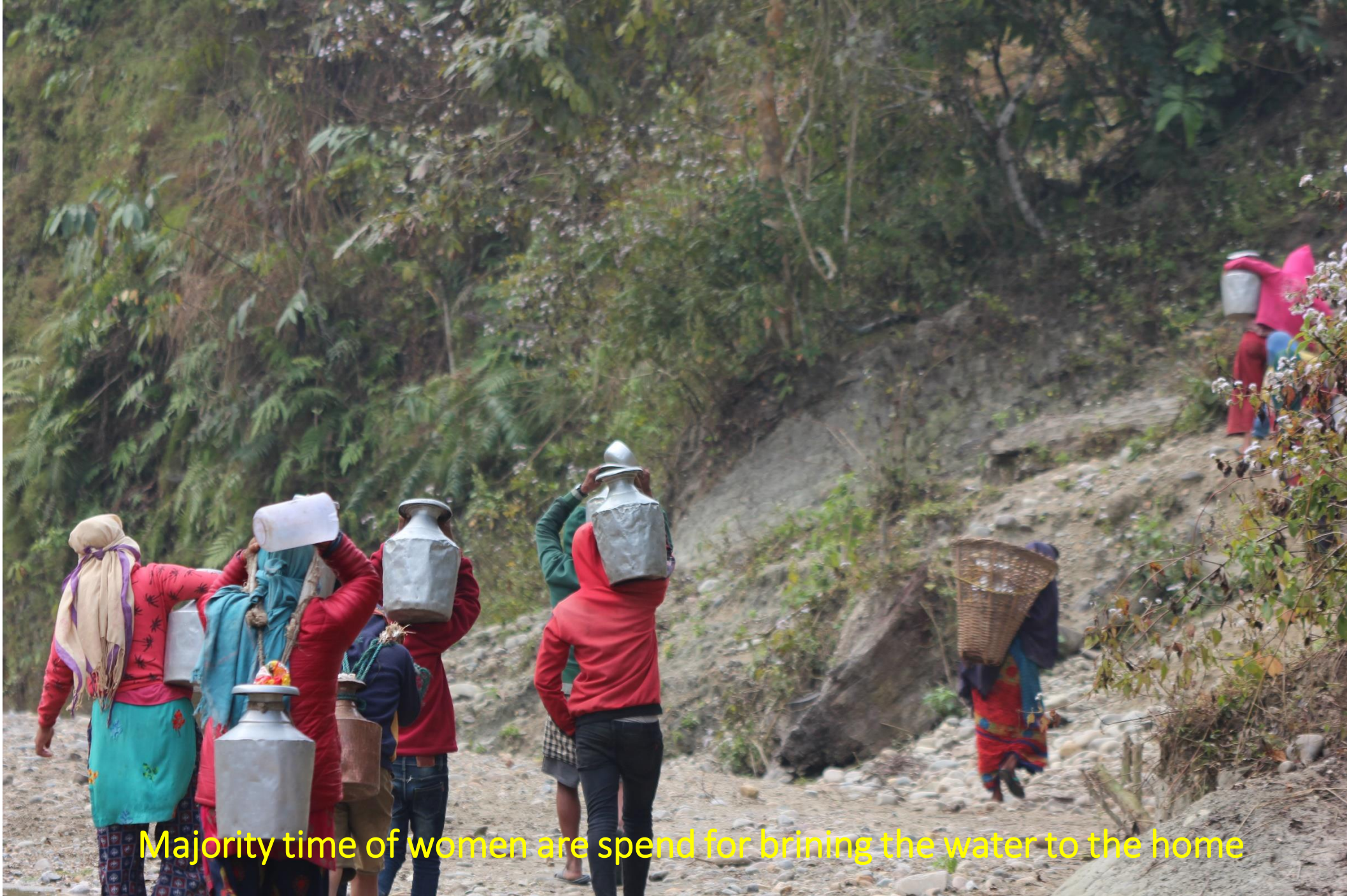
Majority time of women are spend for brining the water to the home