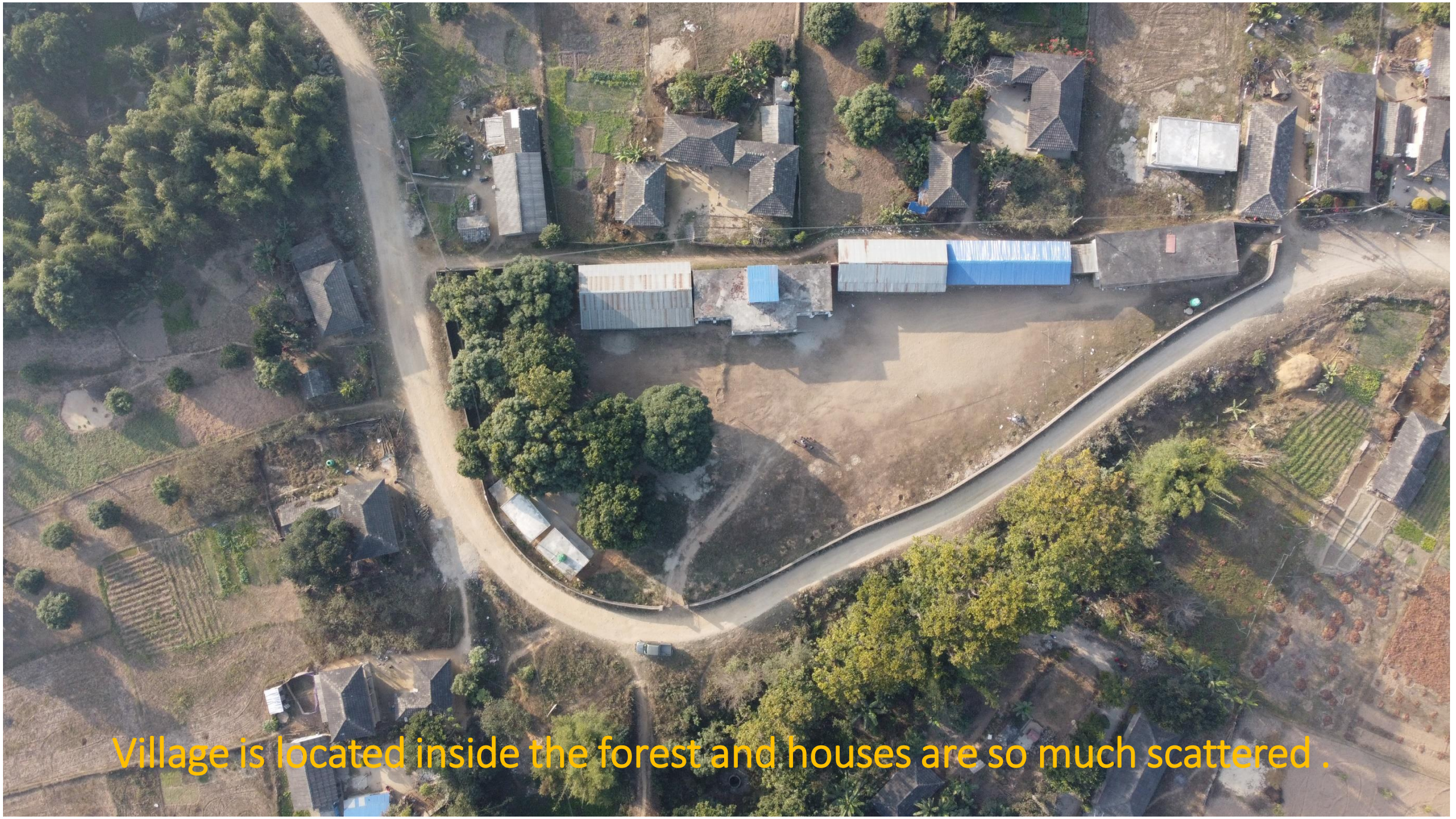
Village is located inside the forest and houses are so much scattered .