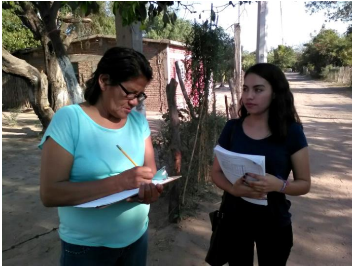
Aplicación de diagnósticos comunitarios en Macochín, Etchojoa. 2017