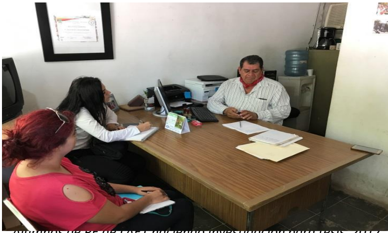
Alumnos de PE de LAET haciendo investigación para tesis. 2017