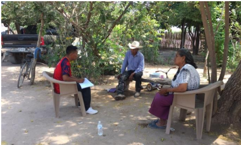
Entrevista de diagnóstico socioeconómico familiar. 2017