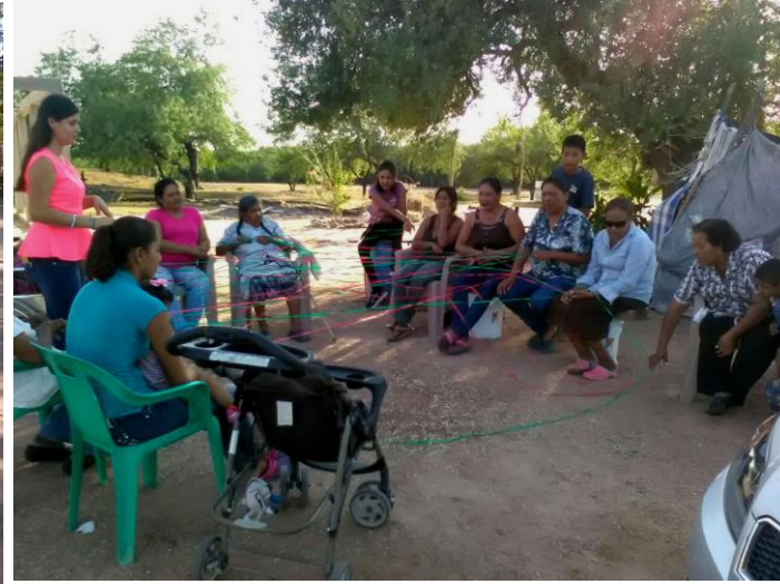
Sesión de identidad comunitaria. Tesotahueca, Navojoa. 2017