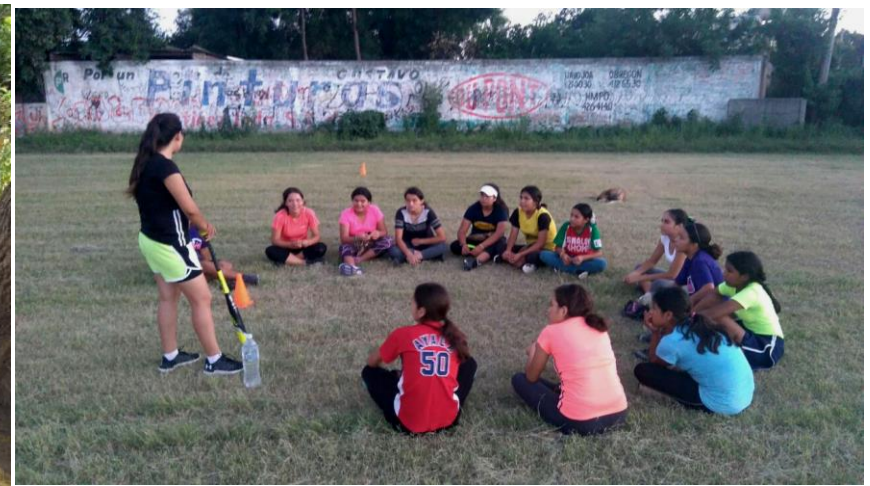
Sesiones iniciales de entrenamiento con equipo de softball femenino de San Ignacio Cohuirimpo, Navajoa. 2017