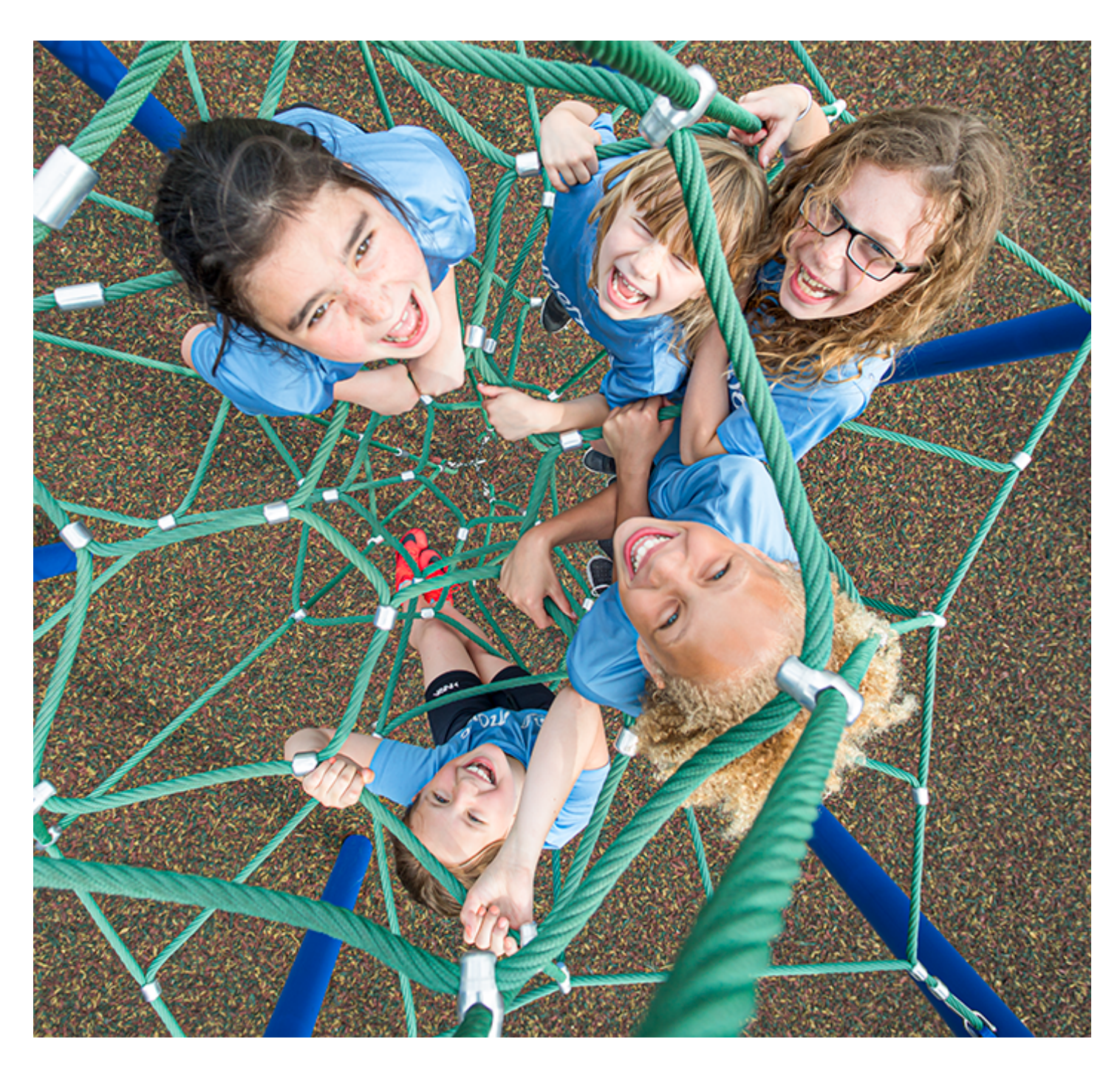
Proposal for Twin Falls SD-Harrison 21358-2A-1