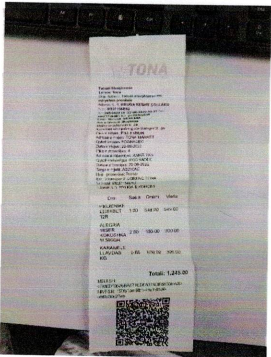
Receipt for supplies for camp from local store.