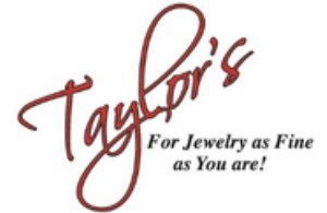
Taylor's Gold and Stone