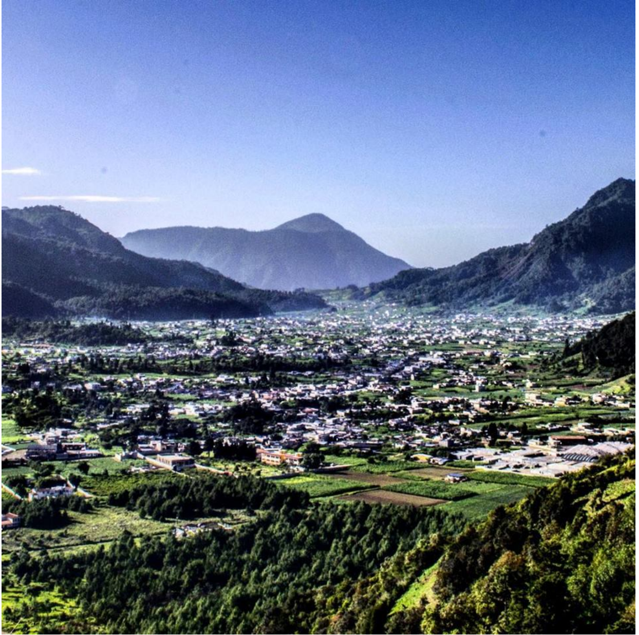
Palajunoj Valley Quetzaltenango, Guatemala