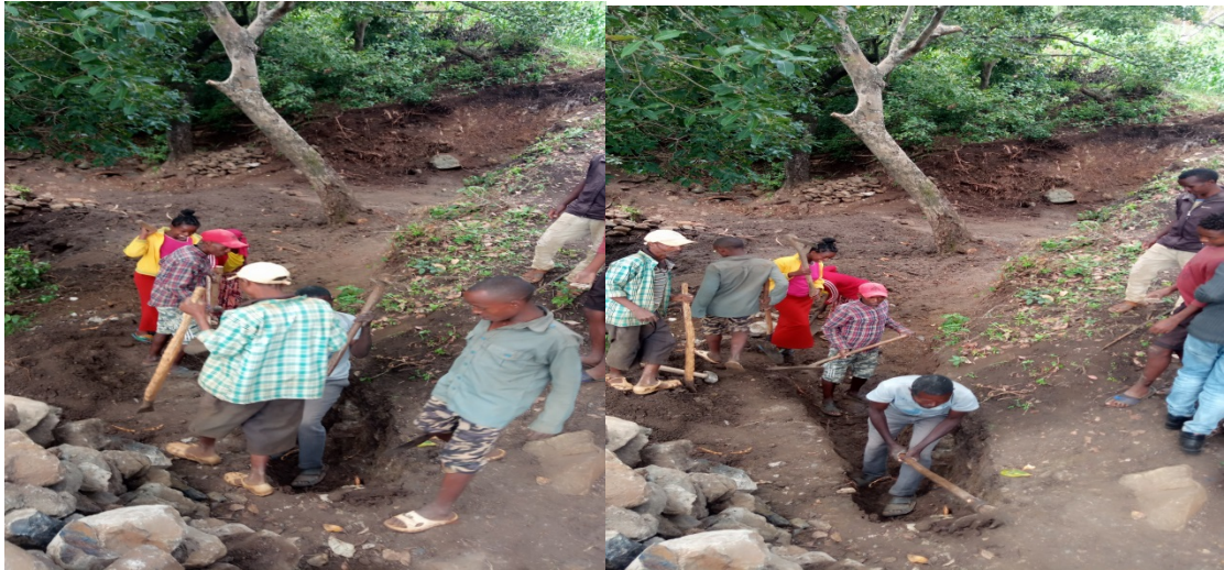
Trench Excavation at Doge Laroso

Local community members excavated the Doge Laroso kebele trench.