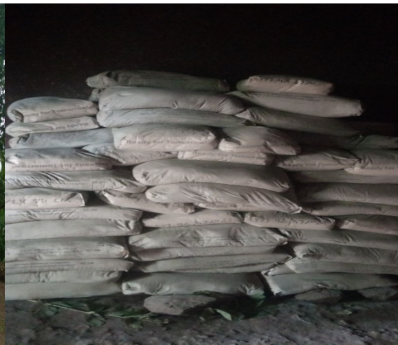
Cement transported to the project site