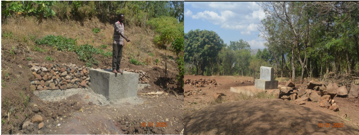
Tulicha Kebele water collection points