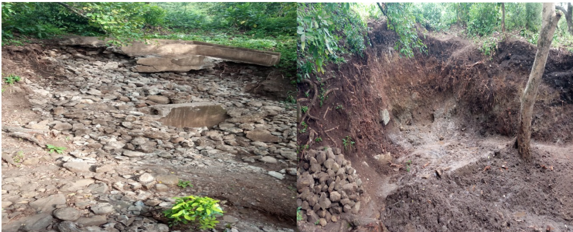
The existing structure at Doge Laroso

Demolishing the existing structure consumed most of the project work time