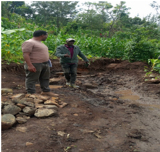
Site Clearance at Tulicha

The Wolaitta Development Association's engineers supervised the site clearance at the Tulicha and Doge Laroso No. 2 sites.