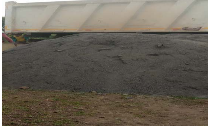
Sand transported to the site