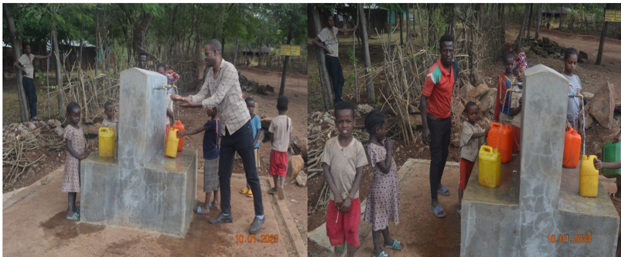
Tulicha villagers collecting water