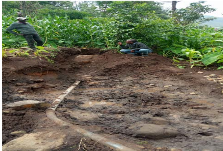
The beginning of bulk excavation work at the Doge Laroso site.