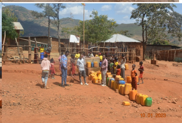
Doge Laroso villagers collecting water