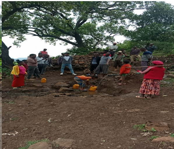
Spring no 2 at Doge Laroso