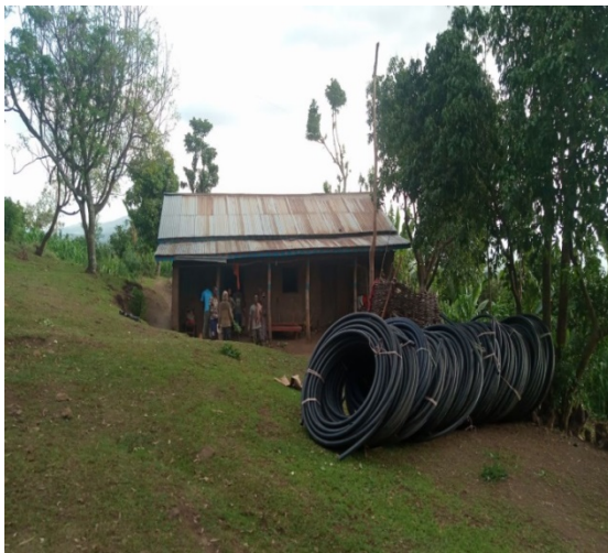
HDP/ Plastic Pipe