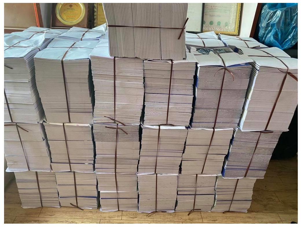
Full year supply of new student notebooks.