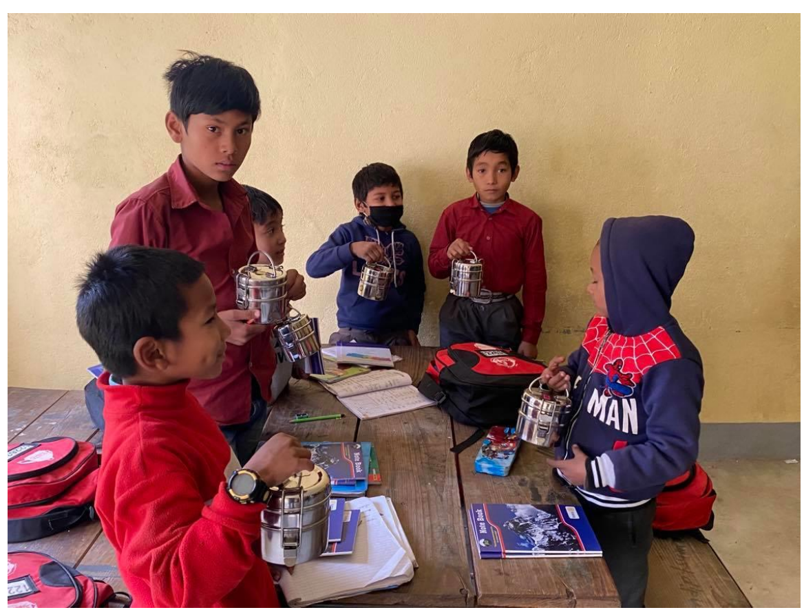
More children receiving notebooks.