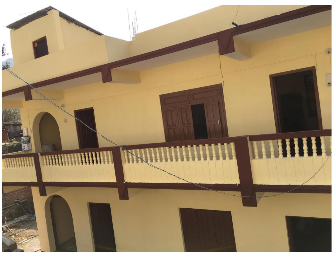
Upper level of completed school reconstruction.