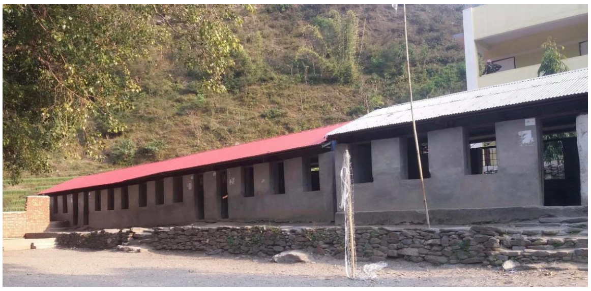
Detail of new roof.