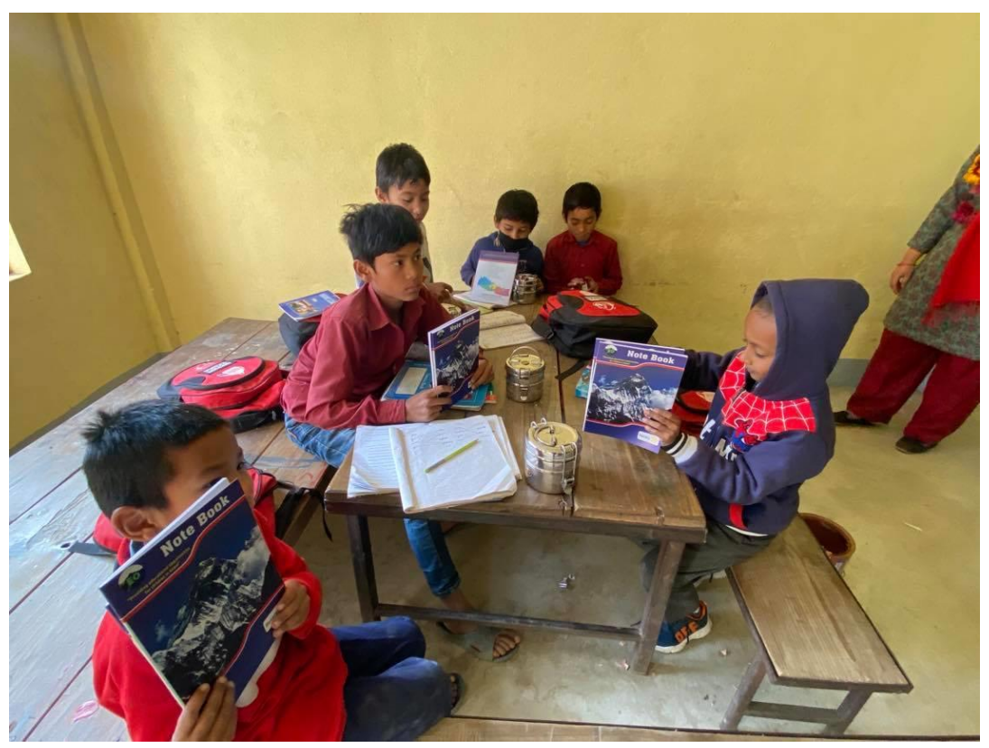
Children receiving notebooks.