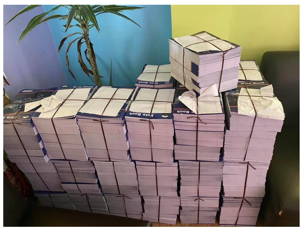
More student notebooks.