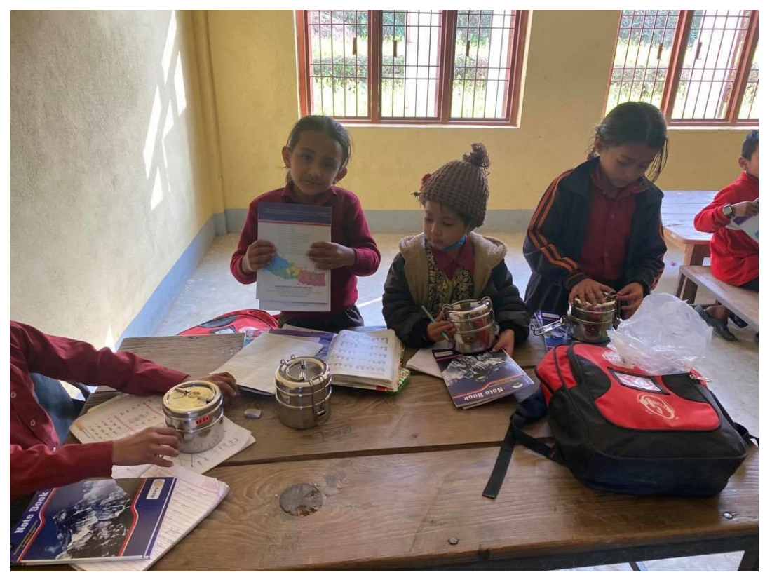
Children receiving notebooks.