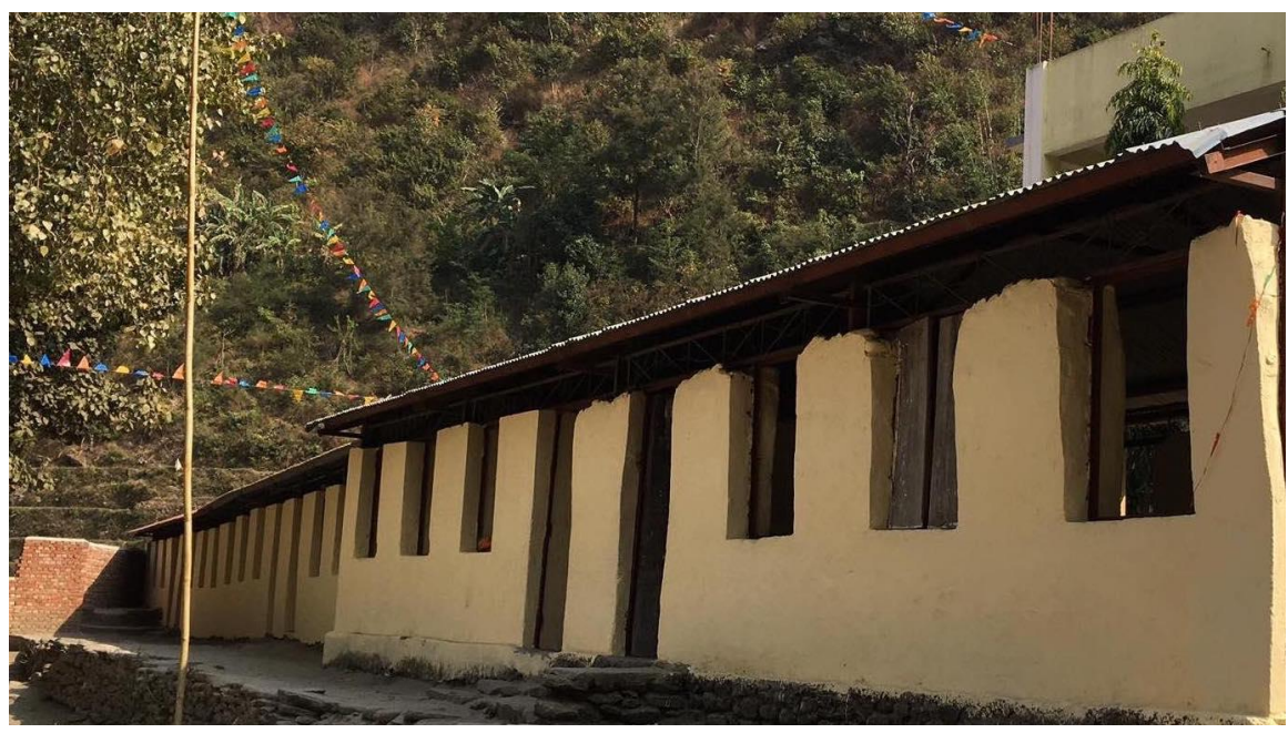
Shree Bal Primary School