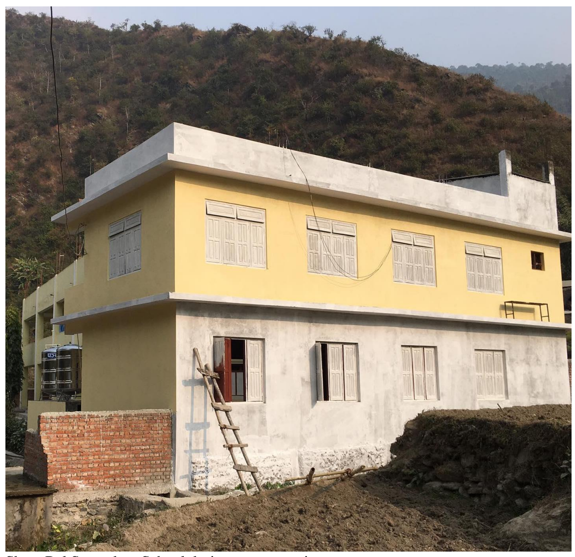
Shree Bal Secondary School during reconstruction.