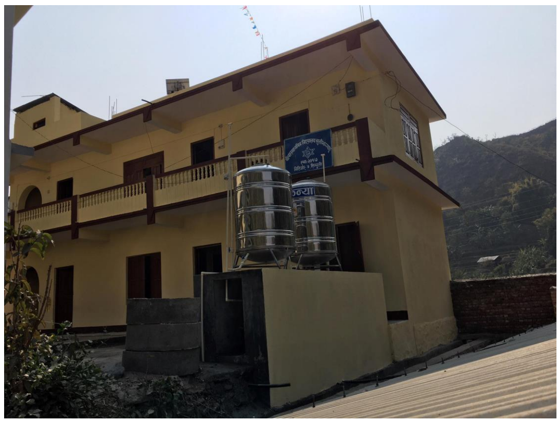
View of upgraded water supply.