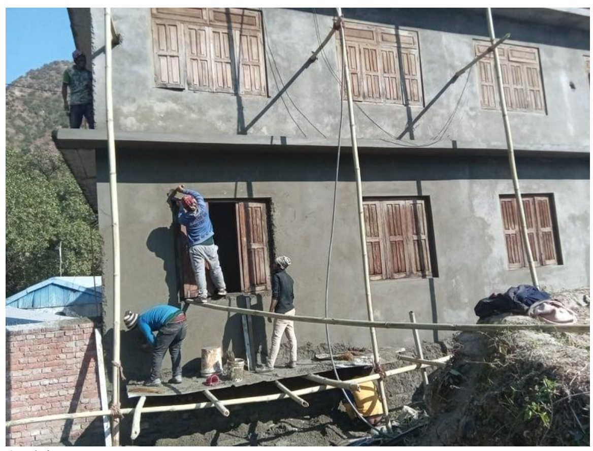
Applying new stucco.