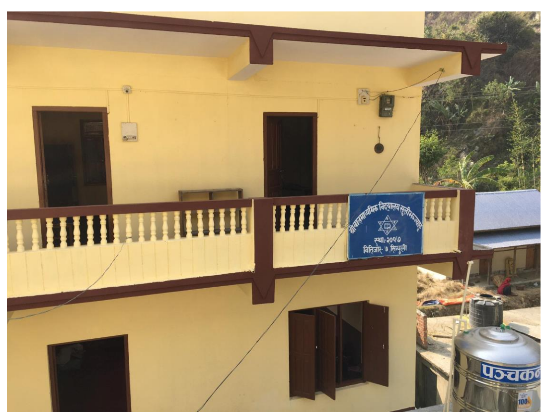
Completed Shree Bal Primary School.