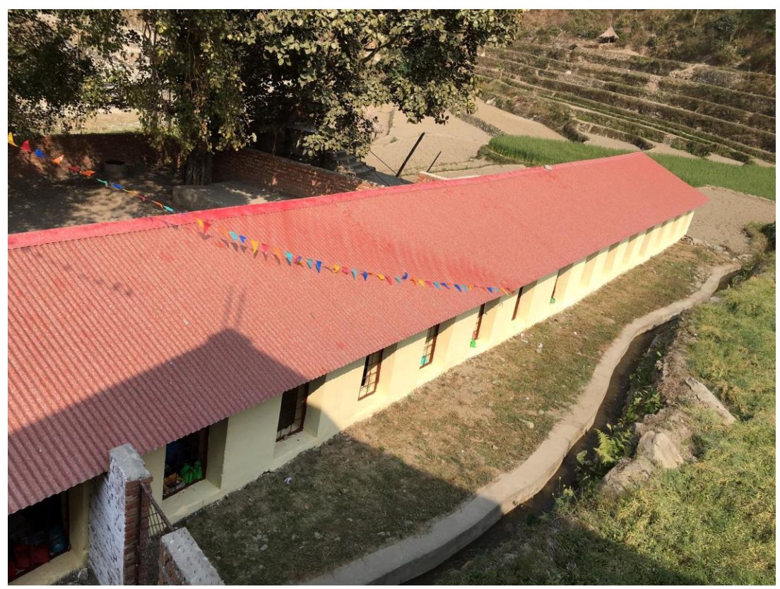
Overview of new roof.