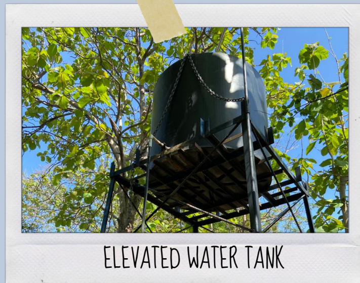
ELEVATED WATER TANK