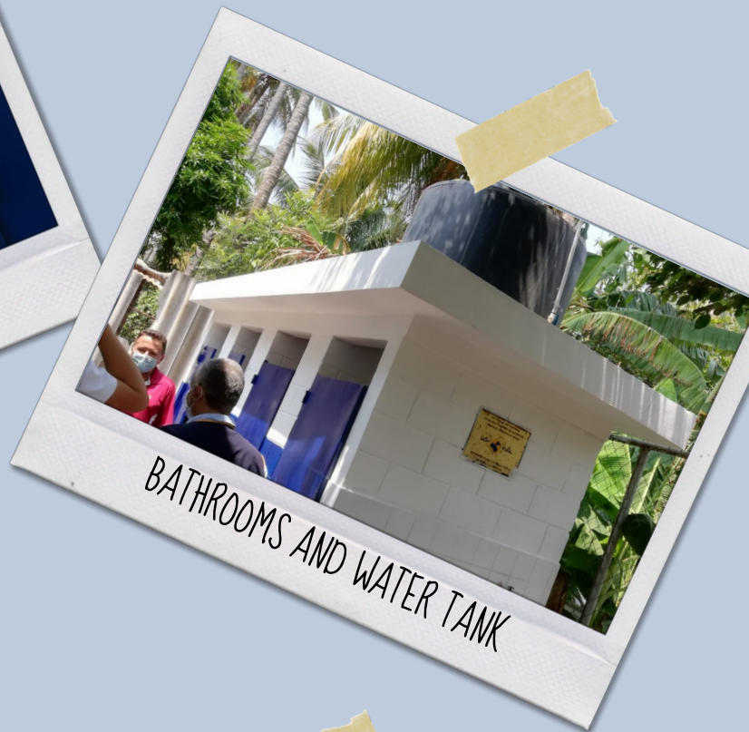
BATHROOMS AND WATER TANK