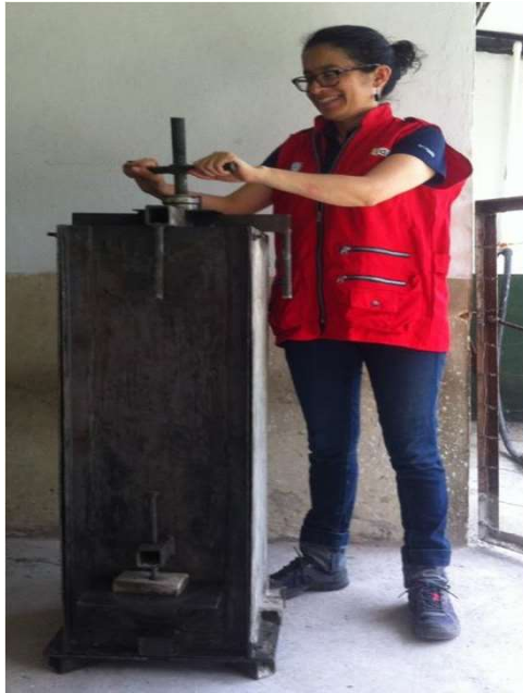
Steel molds- Made in Monteria, Ibague and Piedecuesta