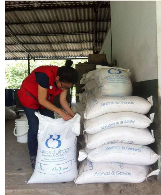
Filter media- ready to install Made in Tolima