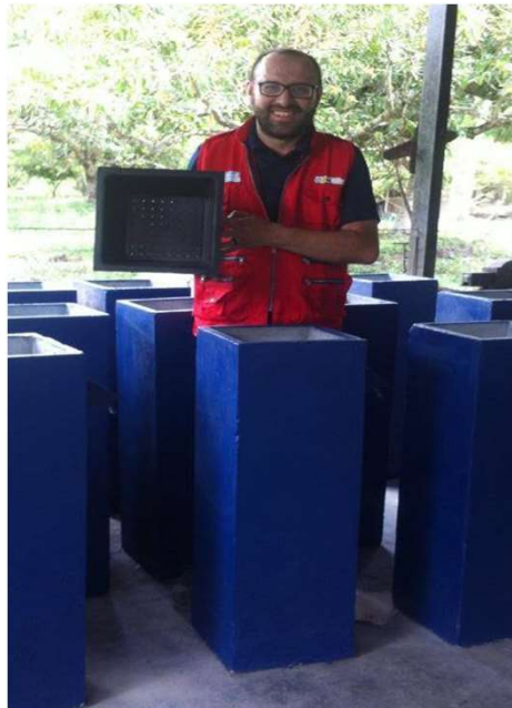
Plastic Diffuser –Made in Bogota