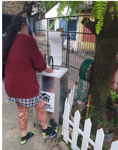
Handover of hand washing stations to community leaders