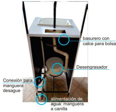
Hand washing stations prototype