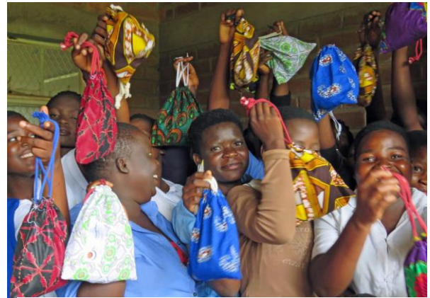
Happy girls in Africa with their new MoonCatcher kits provided by The MoonCatcher Project.