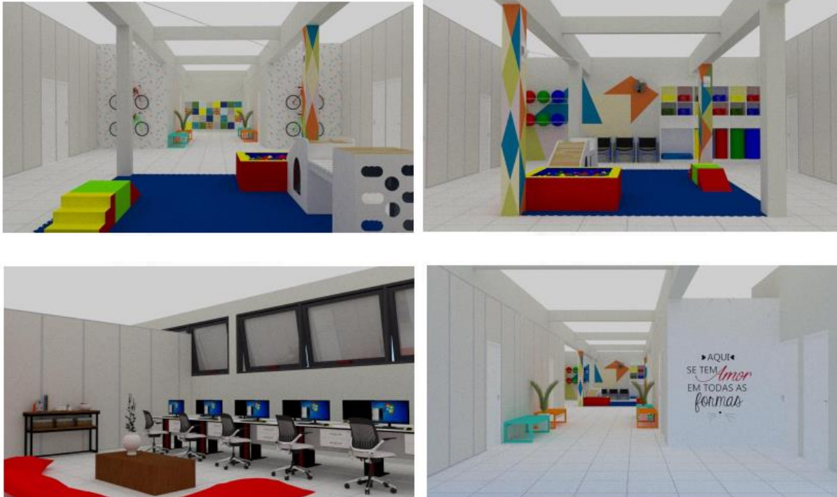
Figure 3 - Illustration 3D preliminary project – room #1, Room#2, Multimedia room and entrance hall

The project consists in supply resource to building a clinic, supply and assembly a series of equipments to apply the treatment of sensory integration and delivery for the Philanthropic institution Piracicaba´s Rehabilitation Center to manage this clinic.