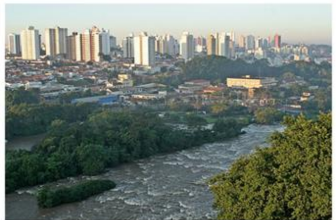
Figure 2 – Photo Piracicaba – Piracicaba River and Downtown Piracicaba

Its Human Development Index (HDI) in 2010 was 0.785, considered high in the ranking of the United Nations Development Program (UNDP), being the 50th largest in the state. In 2012, Piracicaba was ranked by the IPC as the 47th most consuming city in the country, with USD 2.00 billion in consumption, totaling 0.27% of the country. Several highways connect Piracicaba to several cities in São Paulo, such as the Luiz de Queiroz Highway, the Cornélio Pires Highway and Rodovia do Açúcar Highway.