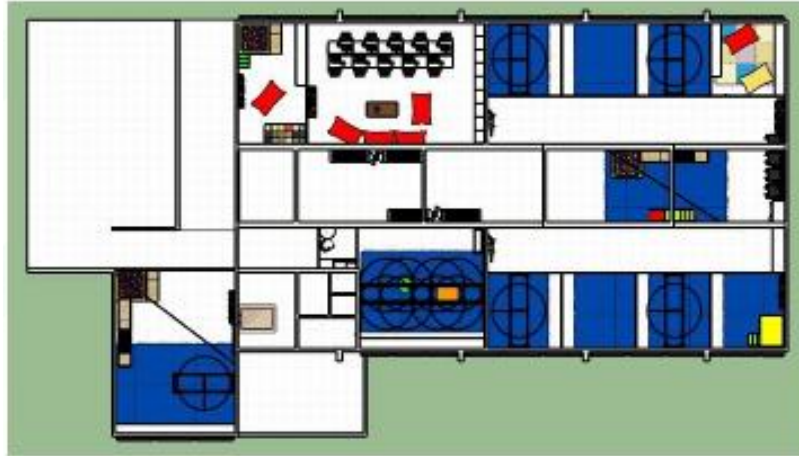
Figure 5 - Illustration 2D floor plan view