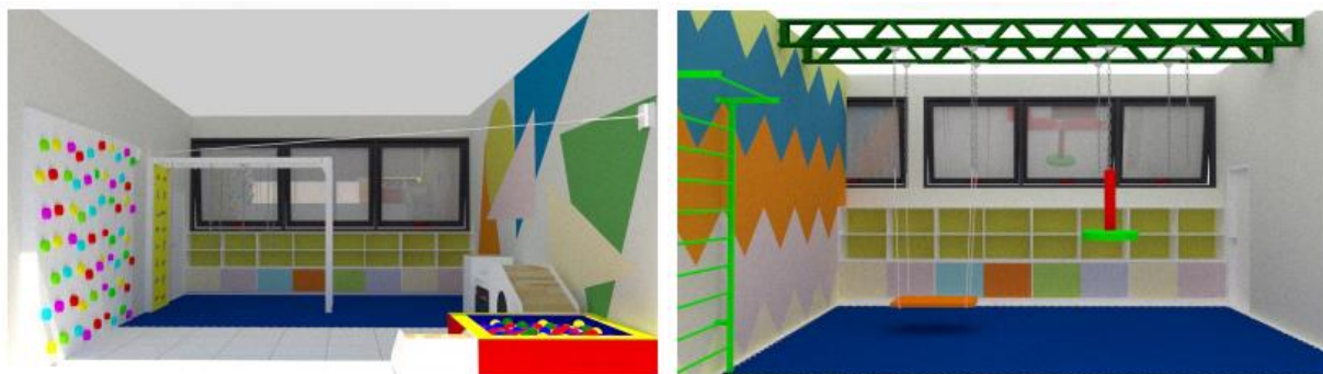
Figure 4 - Illustration 3D preliminary project – room #3 and room#4