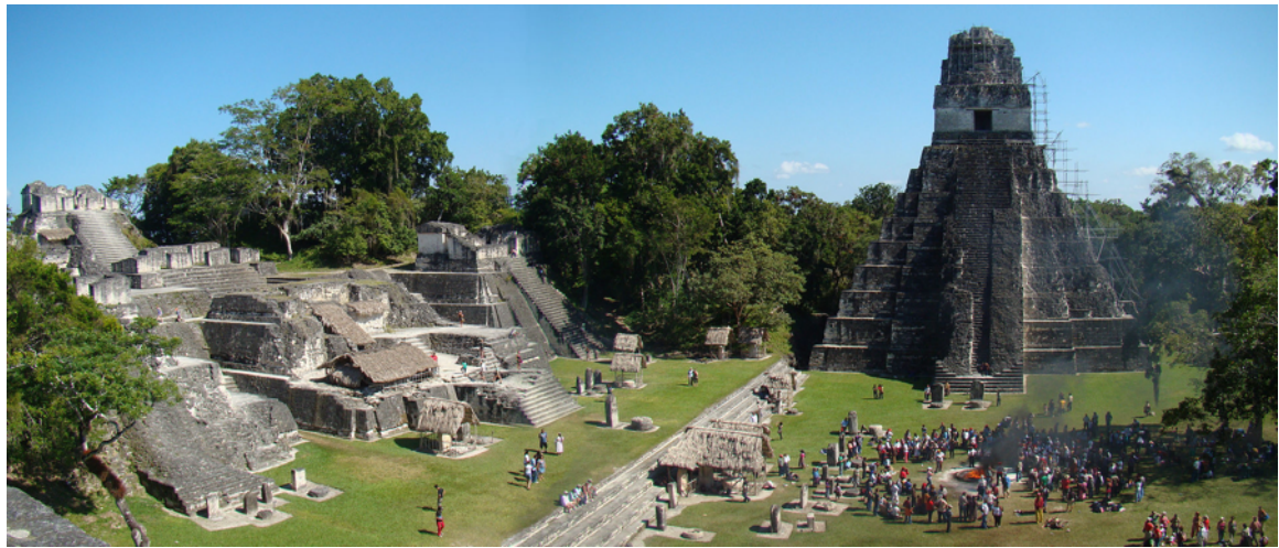
Guided tour of archaeological sites after service trip. Tikal is about 1.5 hrs from La Libertad.