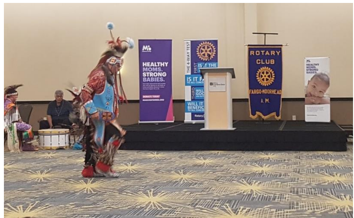
The Buffalo River Singers & Dancers provided dance, storytelling, and drumming for participants to learn more about indigenous culture.