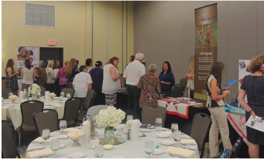
Participants visit posters, to learn more about resources and programs to support moms and babies, especially within other indigenous communities in the Midwest.