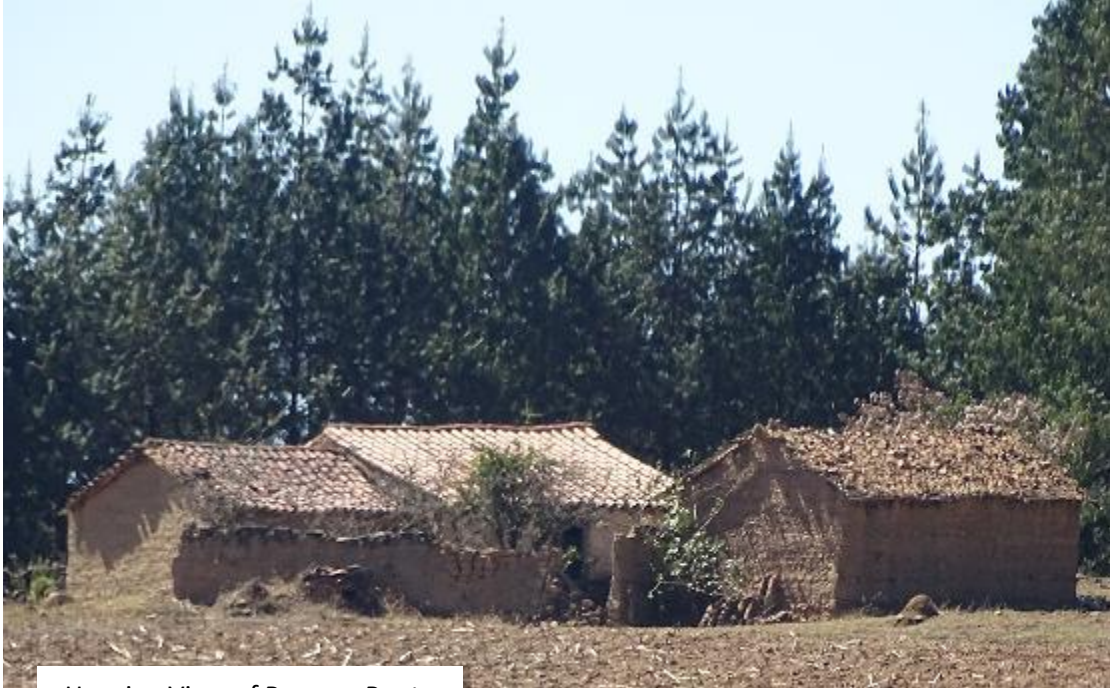
Housing View of Pampas Punta