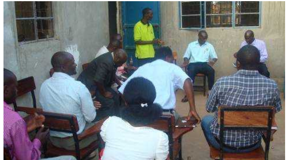
Jinja Rotary Club team discussing mothers of peace project.