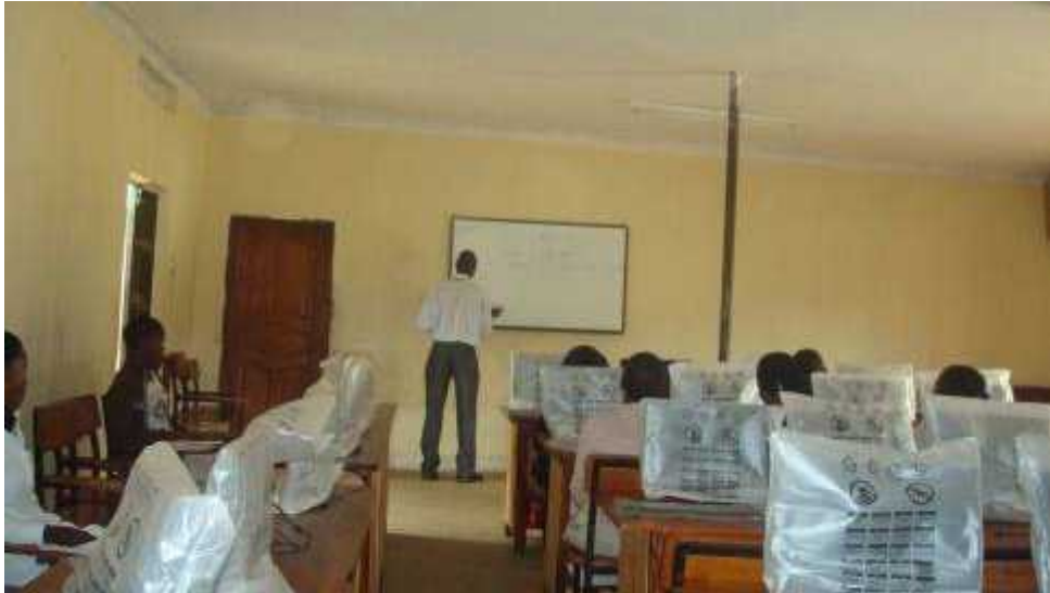
Computer Training in Progress

Mothers of peace project: Final Report in Photos: