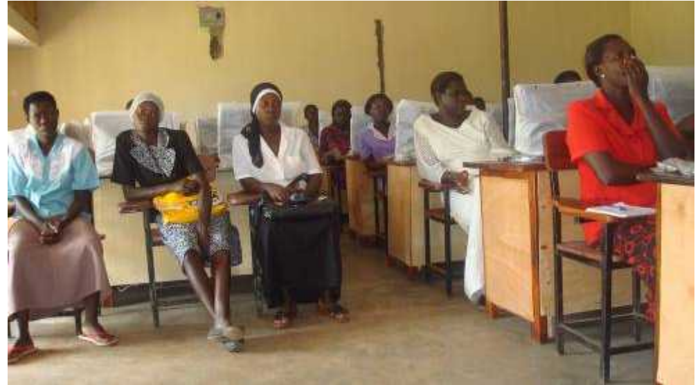
Attentively Listening by Mothers of peace beneficiaries