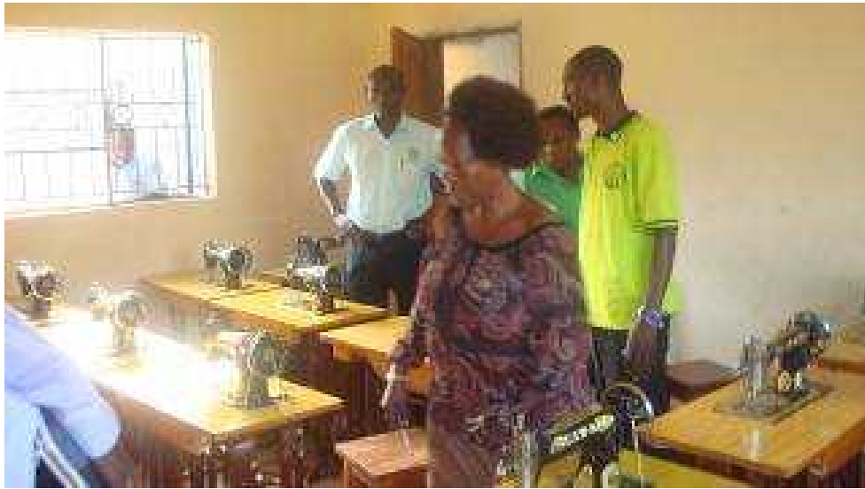
Rotary Club of Jinja counting and confirming the delivered sewing machines.