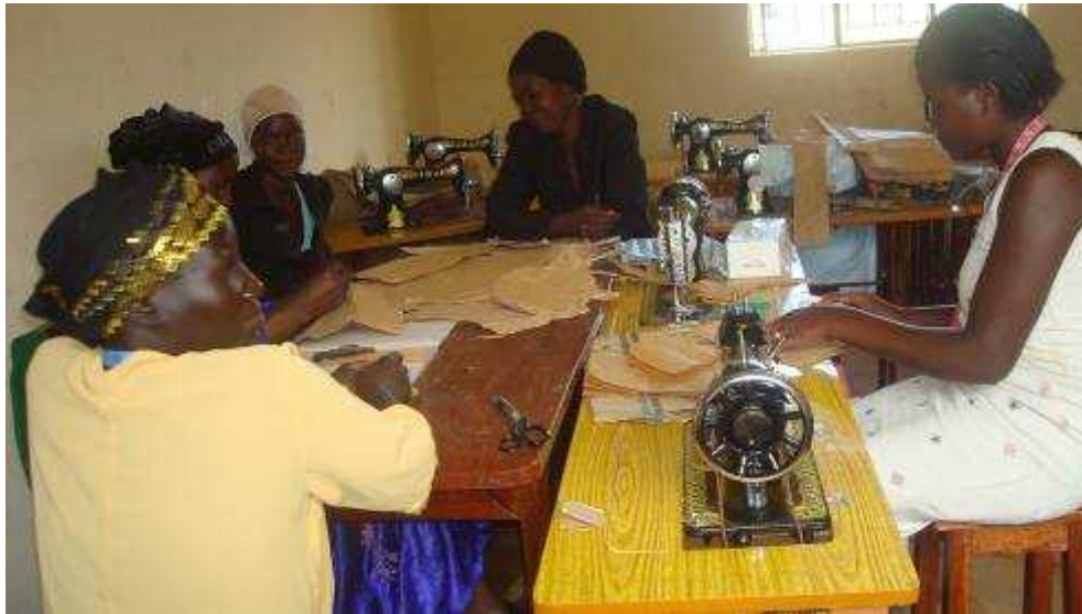
Tailoring class practising the concept of tailoring.