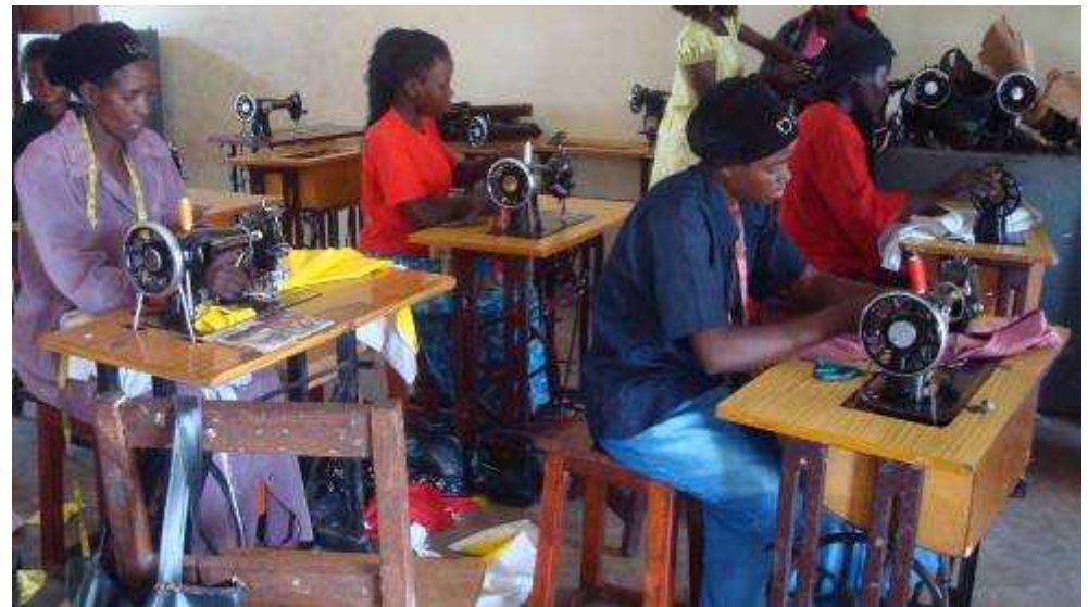
Tailoring practice in progress.