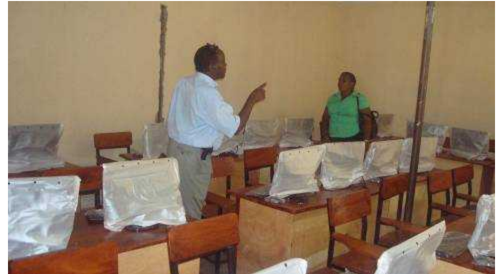
Rtn: Ngalambe, Service projects Jinja Rotary Club verifying the computers