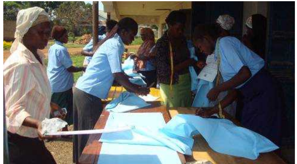
Cutting of clothes for sewing by mothers of peace beneficiaries.