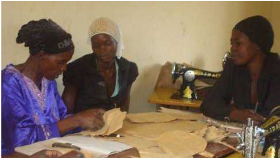
Learning how to cut clothes for sewing.