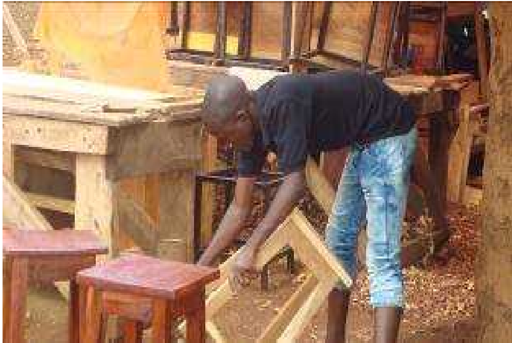
Project stools making in progress