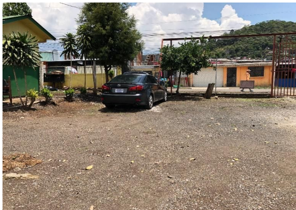
Space where the DENTAL CLINIC could be built

The Clinic will not only provide preventative dental services but also oral health education classes for a population of 19,000 persons.