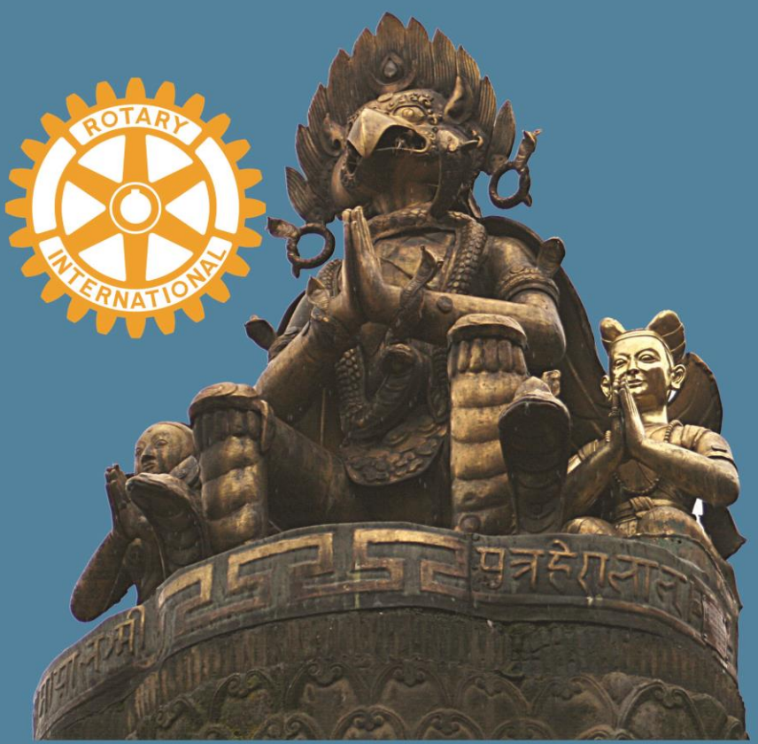
Rotary Club of Dhulikhel

Club No:50576 Chartered Date:25 June 1997