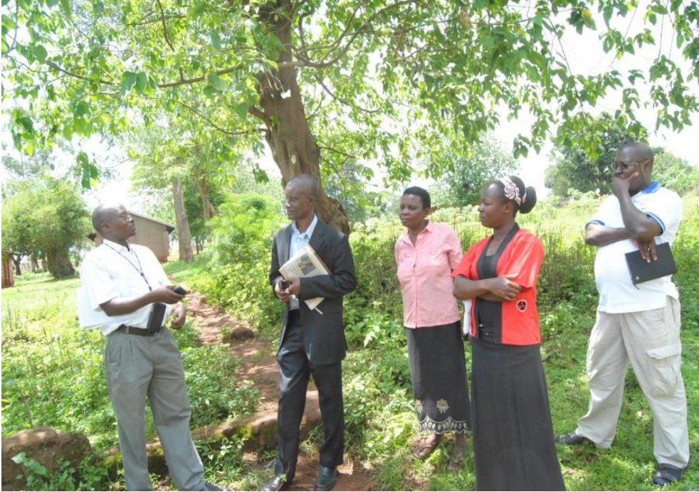
Figure 6-2: SMC Focused Group Discussion at Bukanga P/S