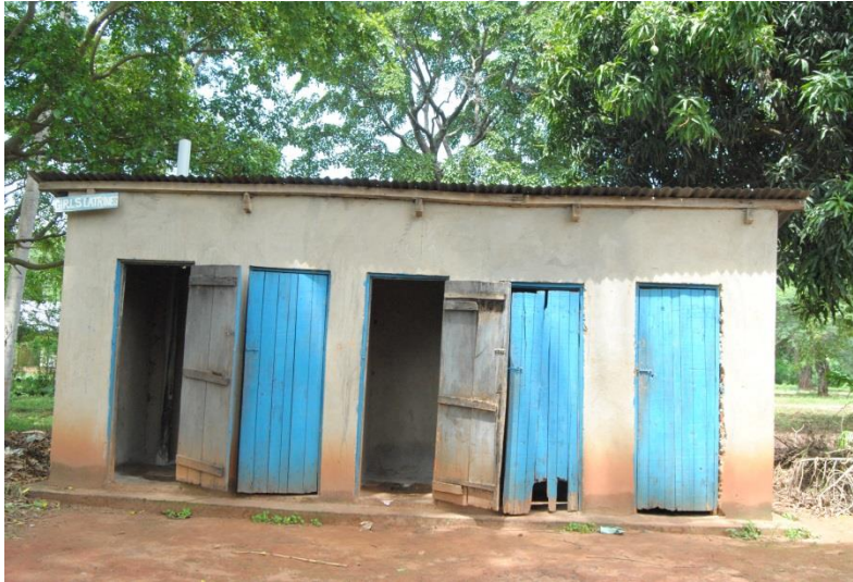
Figure 3-2: Girls' Latrines at Kiyunga P/S