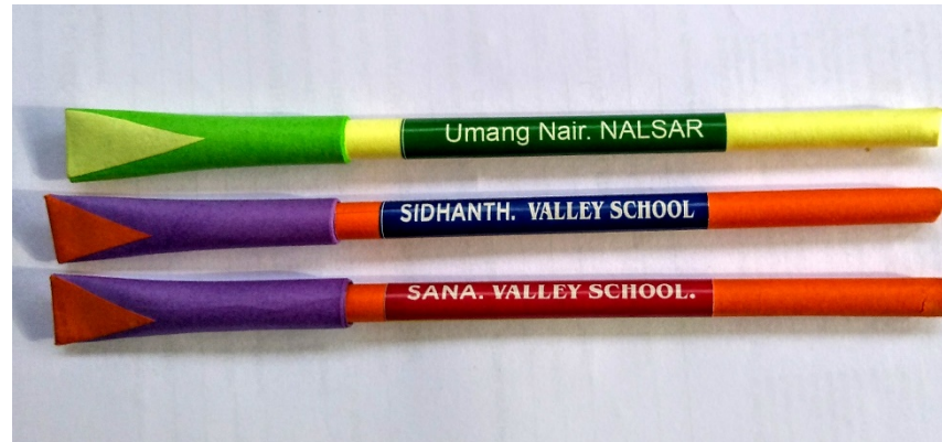
Pens & Pencils made by Patient Trainees