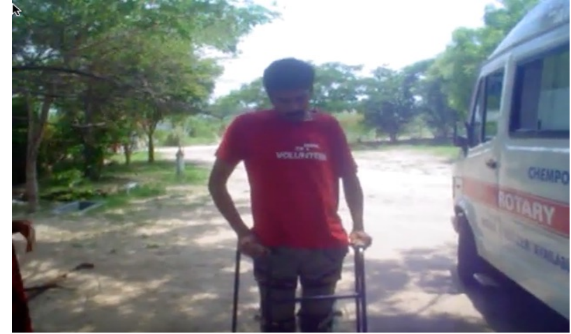
Paraplegic Students with their equipment