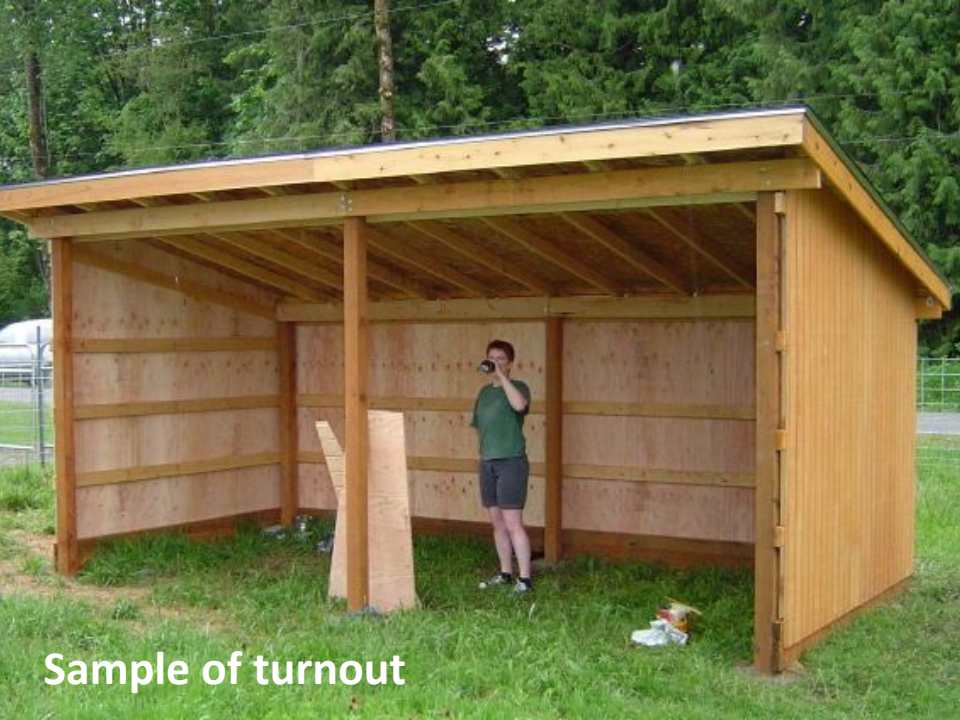
Sample of turnout