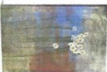
Marguerites II #2045194 16"x24" Solid-Faced Canvas

Regular Price: $154.99 Discount: -$62.00 Sale Price: $92.99