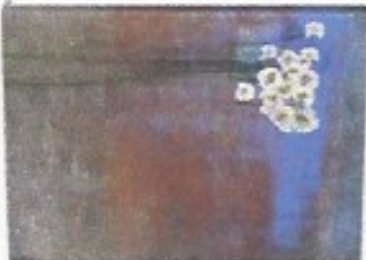
18"x24" Solid-Faced Canvas

Regular Price: $154.99 Discount: -$62.00 Sale Price: $92.99