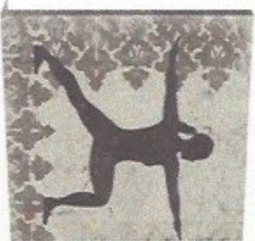
Bliss IV #2330519