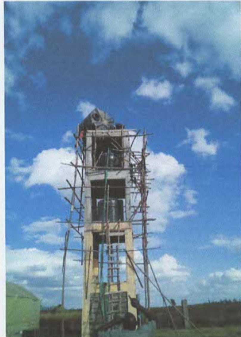
Figure 1 – Progress in the water tower