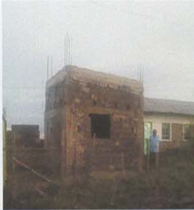
Figure 2 - Gantry foundation walls and slab

Materials required to complete the gantry include floor tiles, cement, pipes, pipe fittings, tank, roofing mabati, paint and labour.