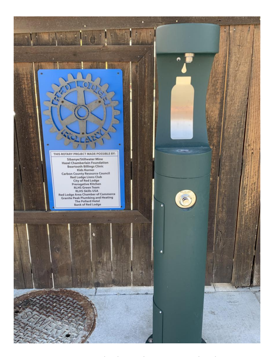
Rotary signage on display in downtown Red Lodge, MT.