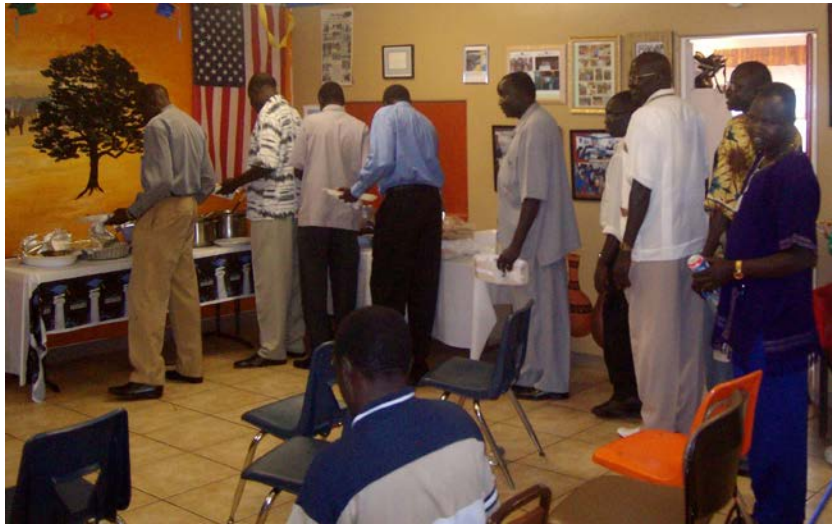
Adults eat first in the Naath culture.