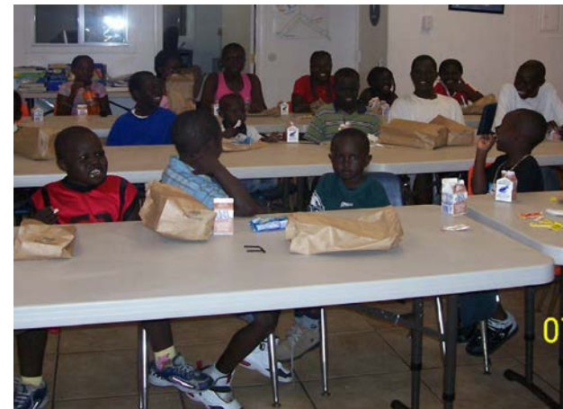
Smiles on faces show language and culture brings kids together in safe community.