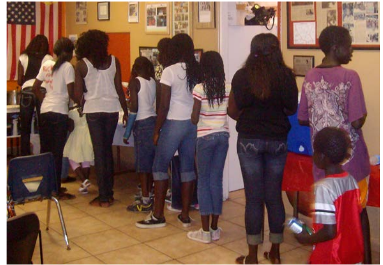
Children follow adults in the Naath culture.