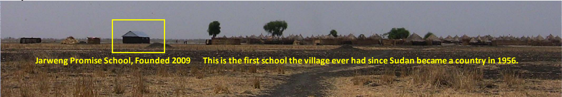
Jarweng Promise School, Founded 2009 This is the first school the village ever had since Sudan became a country in 1956.

JED is a nonprofit 501(C3) charitable organization that builds schools in South Sudan. Its mission is to improve life through better education, health and commerce.