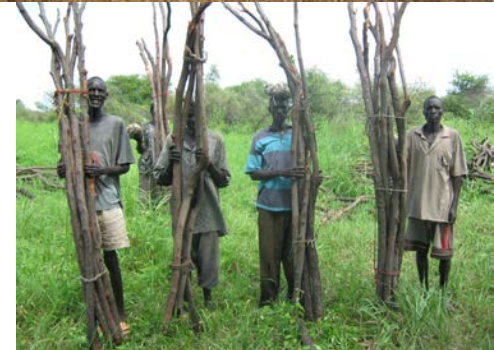
Excited villagers gather and cut wood to construct their new, first time school.