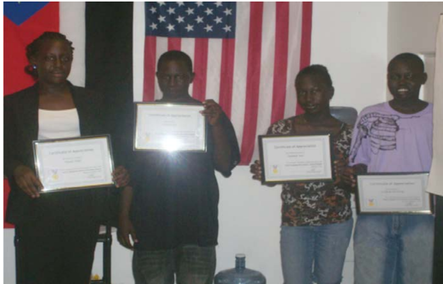
Future leaders in culture and language program.