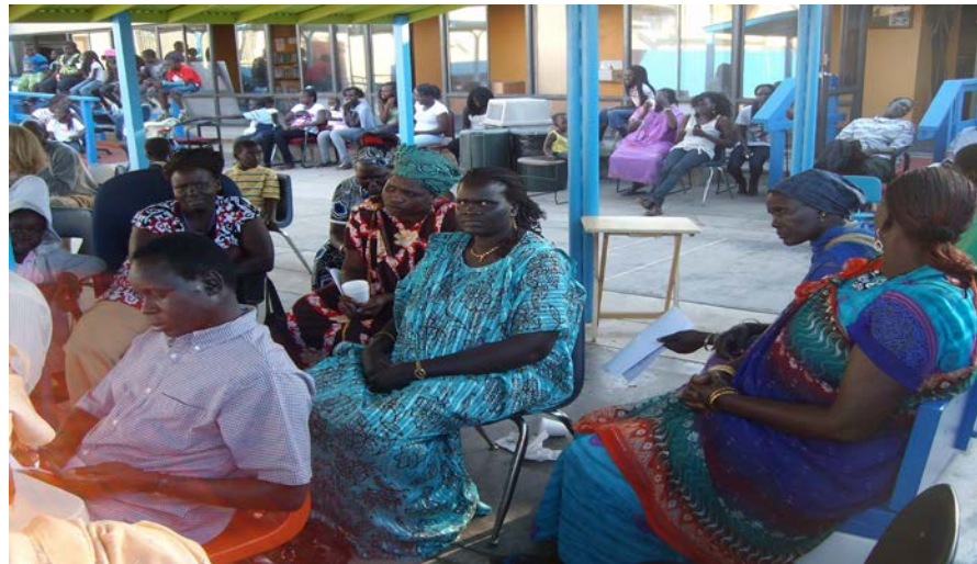
Program inspires family gatherings, learning and community interaction