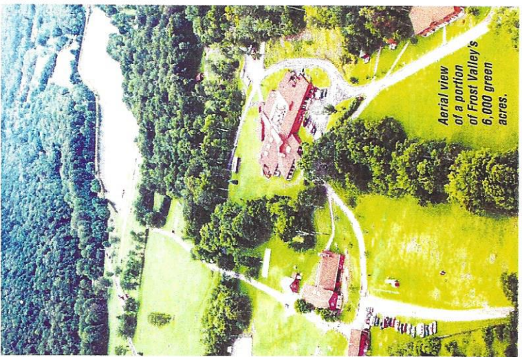
Aerial view of a portion of Frost Valley's 6,000 green acres.

The Ruth Gottscho Kidney Foundation, Frost Valley YMCA Camp, and Montefiore Medical Center