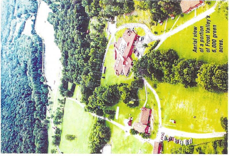
Aerial view of a portion of Frost Valley's 6,000 green acres.

For more information and/or to receive an application, please contact either Frost Valley or the Foundation: